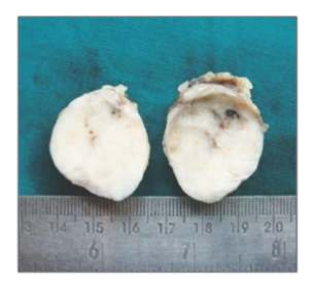
Fig. 1: Gross Photograph of Cut Surface Showing Solid, Pale White and Nodular Areas

epithelium, consisting of inner cuboidal to columnar and outer myoepithelial cells. Ducts showed intracanalicular and pericanalicular pattern with fibromyxoid stroma (Fig.2). Few cystically dilated glands were also noted. Focally ducts showed epithelial cells with vacuolated cytoplasm suggestive of lactational change. There was no evidence of dysplasia or malignancy, so it was reported as ectopic breast tissue with fibroadenoma and lactational change. Immunohistochemistry was done for ER and PR which was negative.